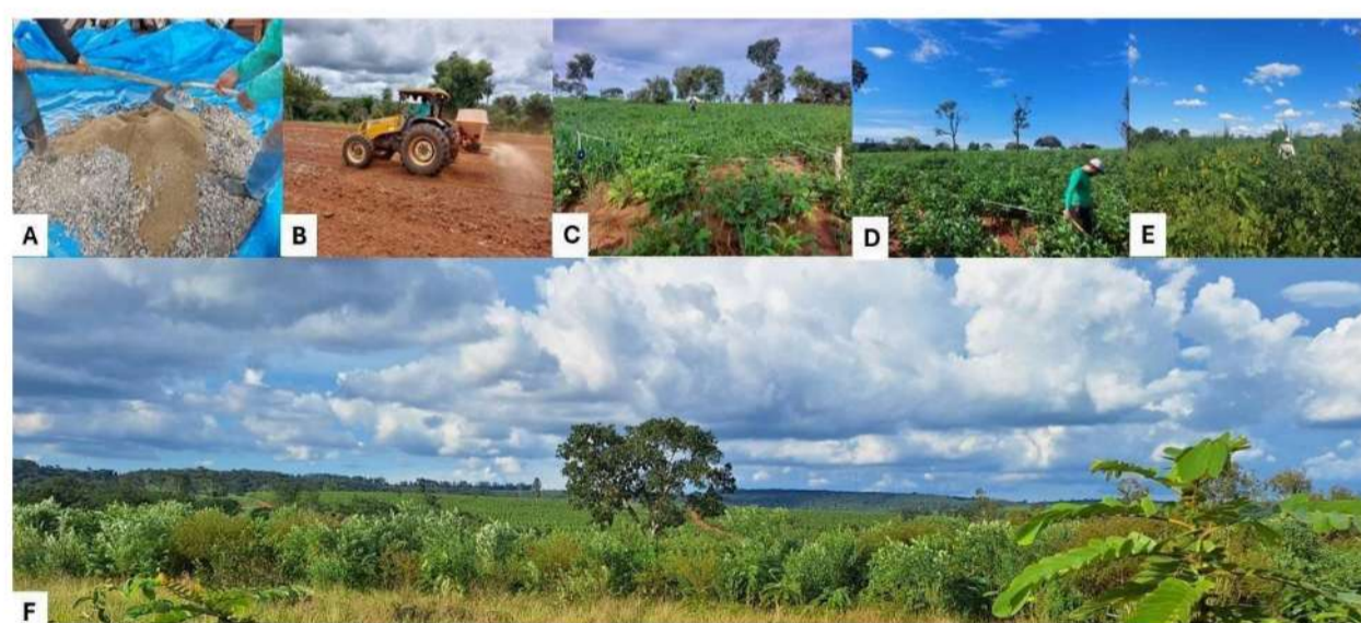
Figure 2: Preparing the material for forest restoration (A), mechanized direct seeding (B), experimental area 63 days (C), 105 days (D), 164 days (E) and 484 days after sowing (F) in Monte Alegre de Minas, MG.

The results from the Sorensen similarity index did not indicate any notable tree species occurrence dissimilarities between the treatments and measurements (Table 4), with treatment DS+BAC+NPK and DS+BAC being more similar for most of the inventories. Considering all the direct seeding techniques, the mean value of the Sorensen similarity index decreases during the measurements, from 0.87 (63 days after sowing) to 0.78 (484 days after sowing).